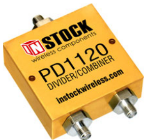
In-Line, SMA-Jack Connectors