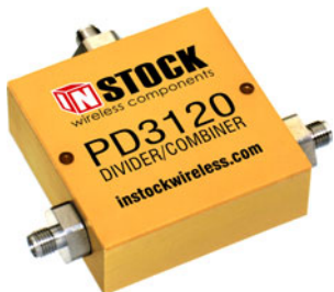
T-Style, SMA-Jack Connectors