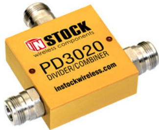
T-Style, N-Jack Connectors