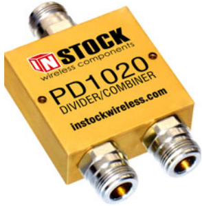
In-Line, N-Jack Connectors